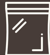
1 GALLON FREEZER BAG