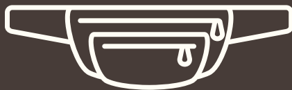
CLEAR FANNY PACK