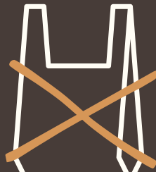
PRINTED PLASTIC BAG