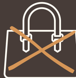
PURSE OR OVERSIZED TOTE